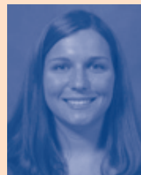
Jamie L. Reichert Auxiliary to the ISVMA Scholarship