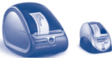
DYMO 400 Only 69.00ea (with the purchase of 25 Packs of labels)

The ISVMA's Annual Business Meeting will be held on Sunday, November 4. The combined meeting and breakfast will begin promptly at 6:30am and is scheduled to finish by 7:45 a.m. to allow participation in the 8:00 a.m. educational sessions. The meeting will be held at the Peoria Civic Center General Session Room off the Trade Show Floor.