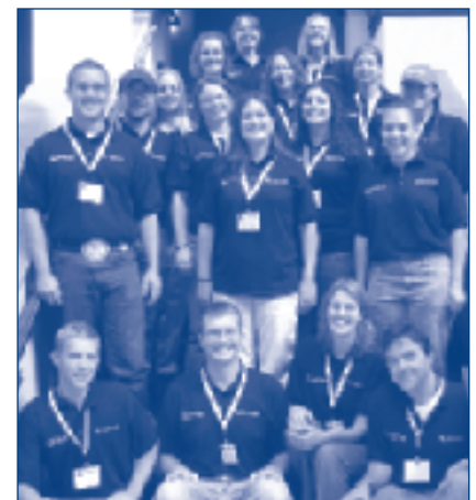
Members of the University of Illinois School of Veterinary Medicine AAEP Student Chapter at OEPS.