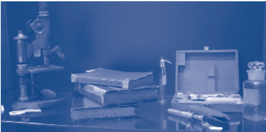
The legacy and contributions of veterinary medicine in Illinois is proudly displayed at the new Walter E. Zuschlag/ISVMA Veterinary Heritage collection and Information Commons.