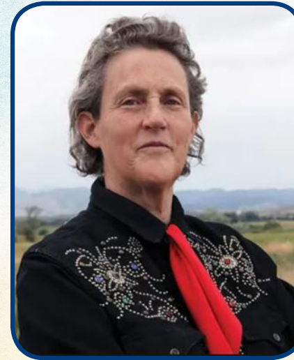
Temple Grandin, PhD Colorado State University

“Through groundbreaking research and the lens of her autism, Temple Grandin brings startling insight into two worlds (animal welfare and autism).”