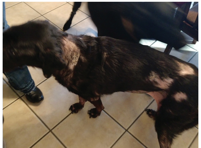
Figure 3: A dog with hyperadrenocorticism. Note the muscle wasting on hips and muscles of mastication, marked alopecia and secondary skin changes (including calcinosis cutis).

Dogs often present with a vague history; clinical signs may be overlooked by the owner, or presented as “age related changes”. A thorough history and clinical examination are important to make a diagnosis of Cushing’s syndrome.