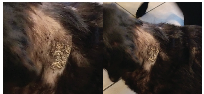
Figure 4: Close-up view of calcinosis cutis.